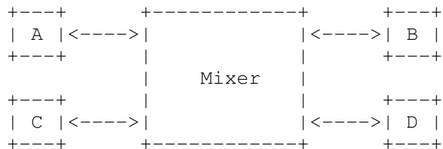
Figure 2: Example RTP Mixer topology

An RTP session using a mixer might have a topology like that in Figure 2. In this examples, participants A-D each send unicast RTP traffic between themselves and the RTP mixer, and receive a RTP stream from the mixer, comprising a mixture of the streams from the other participants.