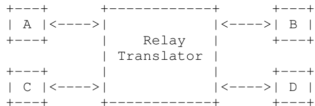
Figure 3: RTP relay translator topology

Figure 3 shows an example transport translator, where traffic from any one of the four participants will be forwarded to the other three participants unchanged. The resulting topology is very similar to Any source Multicast (ASM) session (as discussed in Section 2.4), but implemented at the application layer.